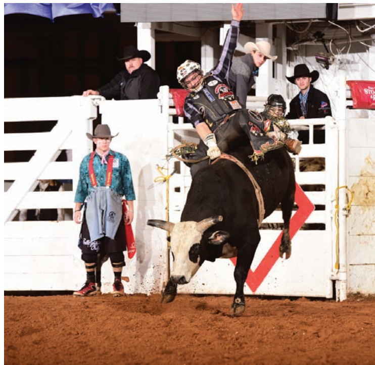
Ednei Caminhas spurring one at Fort Worth, TX- Intense Riding