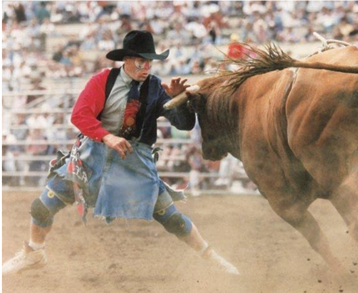
Rob Face To Face With Bull

EXPECTATION: See people saved, set free, healed spiritually, physically, and emotionally, filled with the Holy Spirit, and living a life pleasing to God.